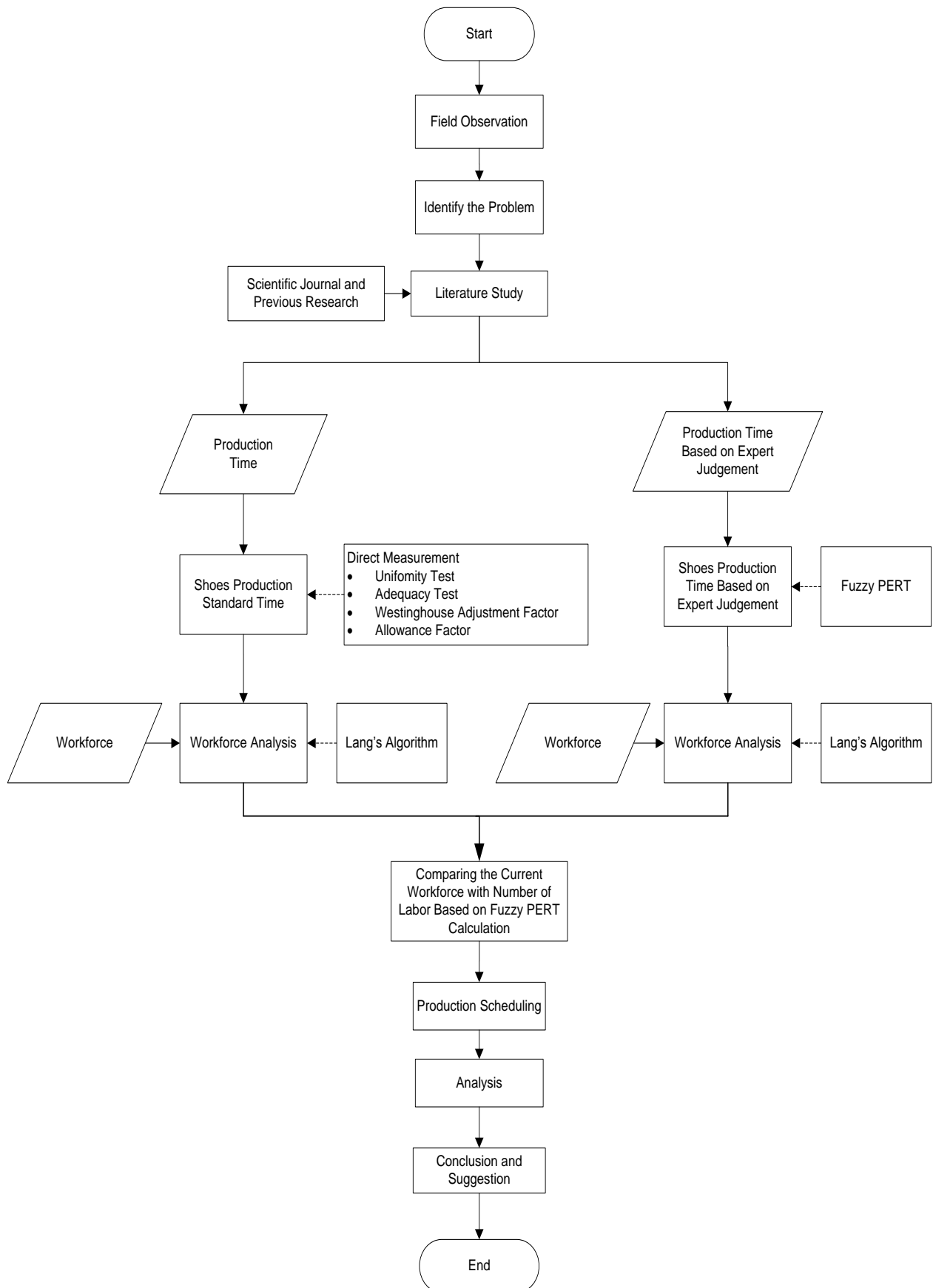
Figure 1. Research Method